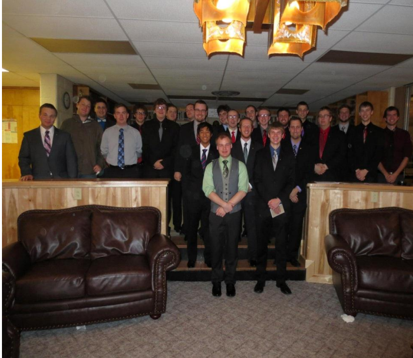
Triangle Pinning Fall 2012