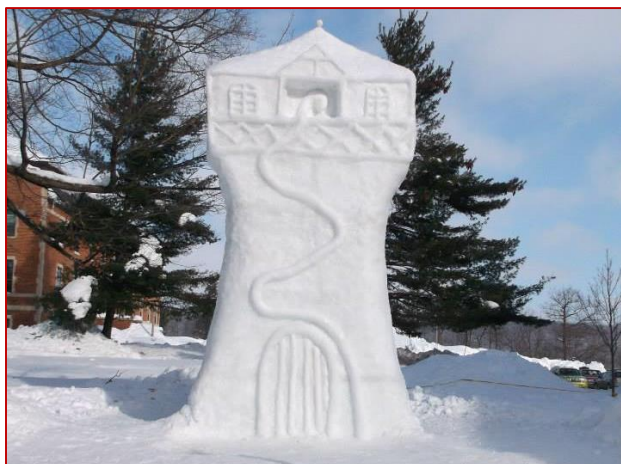
This year's winter carnival statue theme was "Nostalgic Films of Childhood Days come to Life in Frosty Ways" and we chose to build Rapunzel's Tower from Tangled