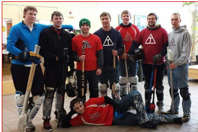
Triangle won 1 st place in the Fraternity division of the 2014 Winter Carnival Broomball tournament!